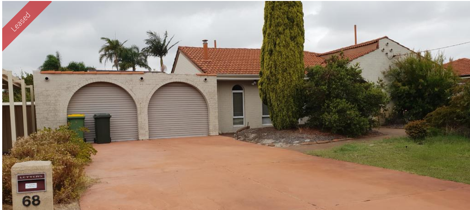
68 Wheatley Drive, Bull Creek