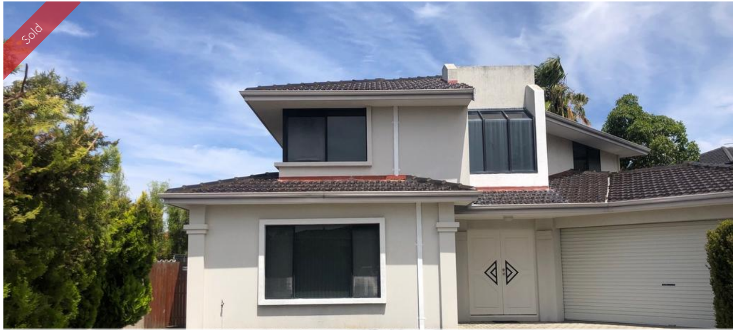
7B Callaway Cres, Kardinya